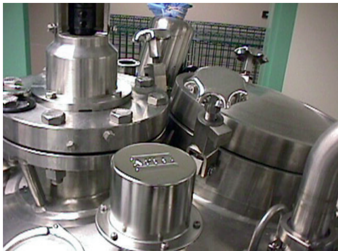
Fig. 1: SoClean® transmitter

Temposonics has liquid level transmitters installed in applications that utilize clean-in-place (CIP), steam-in-place (SIP), and autoclaves for sterilization. The hygienic design has allowed all of Temposonics's customers to validate the cleanability of the wetted parts of the level transmitter in their processes. The customers are across multiple sanitary industries including pharmaceutical, biotechnology, and food & beverage. A unique design feature of the LP-Series is the ability to remove all the electronics without removing the wetted parts from the tank or breaking the seal on the tank. With the electronics removed the wetted parts can be kept in the tank at elevated temperatures without any risk to damaging the electronics or having to open the tank and risk contamination.