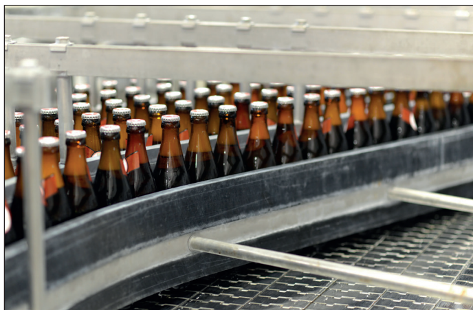
Fig. 4: Bottle Filling Machine

measurement but the Temposonics level transmitters maintain accuracy because the sensing element is enclosed in the sanitary pipe and does not come in direct contact with the liquid.