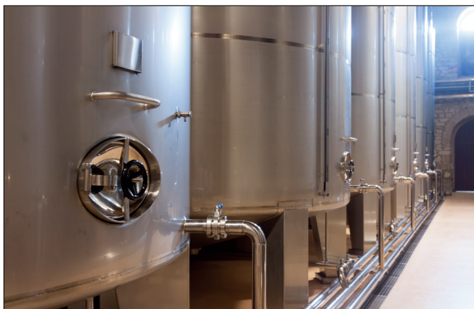
Fig. 3: Stainless Steel Wine Barrels (Designed by Bearfotos / Freepik)

Nobody likes paying taxes and absolutely nobody likes paying more taxes than they need to. Distilleries in the US are required to pay tax on their production volume and not their sales volume. To help minimize taxes the distilleries faced a difficulty of needing an accurate level transmitter that could be used in a hazardous area on large storage tanks. Temposonics and the Tank SLAYER® were able to meet the requirements by providing an intrinsically safe rating, +/- 1 mm inherent accuracy, and an order length up to 72.2 feet (22 m). The accuracy of the Tank SLAYER was able to help the distilleries to save on wasted product and wasted taxes. The complete construction of 316 stainless steel (1.4404) allowed for a cleanable service and no concerns about product contamination.