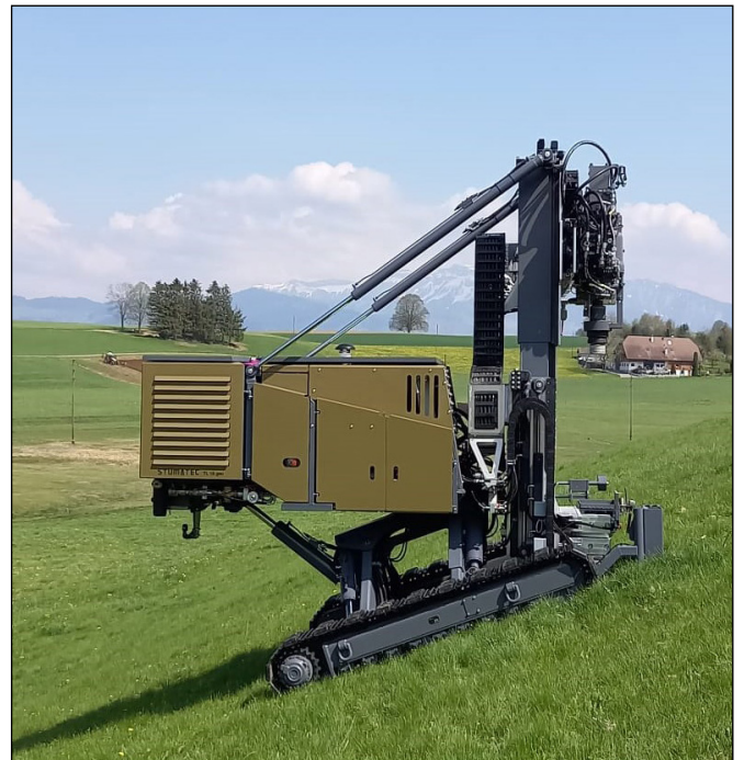
Abb. 3: The TL18 geo manages steep slopes without an auxiliary ramp