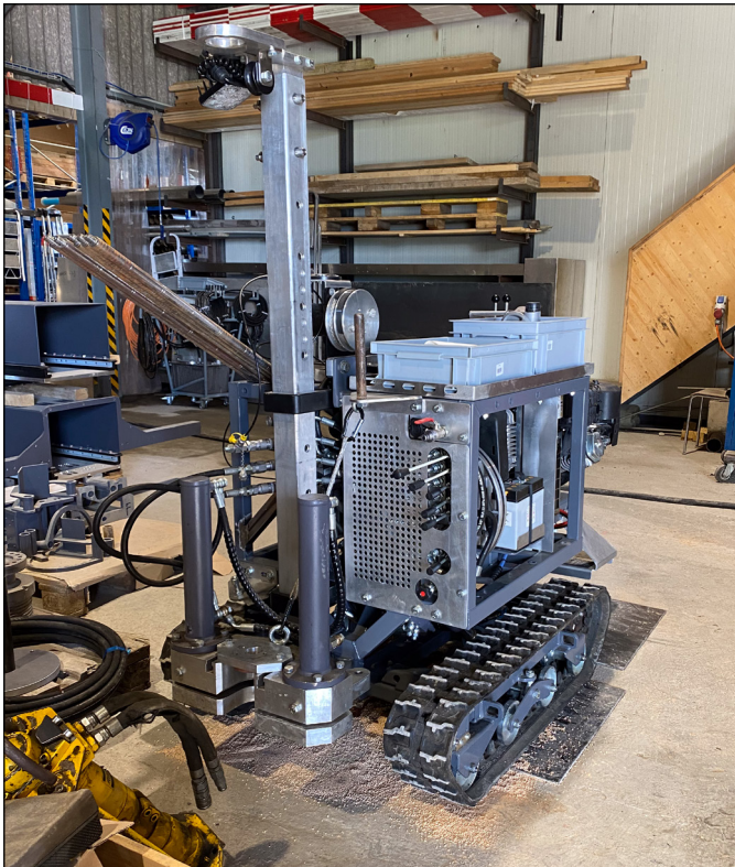
Fig. 4: Prototype of from the Studersond Group

A future project is to build a smaller version of the already existing TL18 geo. “The drawings and design are ready. We have already received the cylinders from AGIROSSI with integrated Temposonics® sensors. Now we just have to build the machines,” Mr. Studer tells us. “As mentioned at the beginning, the TL18 geo has been developed from our own needs. The smaller version will be cheaper and more compact, making it accessible to a wider audience.”